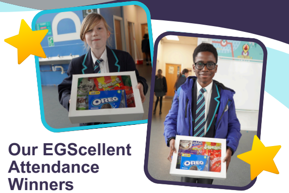
Our EGScellent Attendance Winners

PRINCIPAL'S VLOG Friday 17 th April 2026