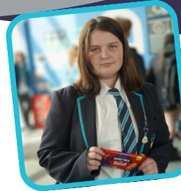
Our EGScellent Attendance Winners